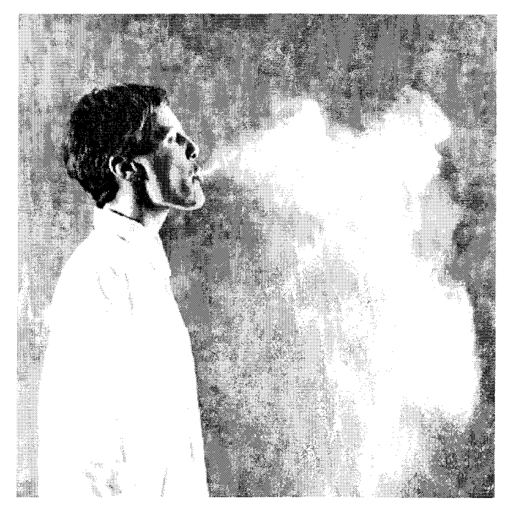
(body object series) #16-flourbreath, 1993

Hamilton's work is characterized by treading the taut line between nature and culture, and by engaging the body so fully into her spaces that boundaries of intimacy are routinely transgressed. Architectural space and inhabitation figure into her sensibilities, and she traces the sublime through haptic cognition. In many of her past constructions, interior cavities of the body commingle with the room and vice versa. Any one of Hamilton's complex spaces require inhabitation and each lies beyond description, yet most serve to illustrate the bodily presence as thematic in her work. In malediction, she repeatedly stuffed a piece of bread dough into her mouth until it took the form of the mouth's hollow cavity. 11 These oral impressions were then collected in a basket casket for the duration of the show. During indigo blue, saliva applied by the artist's tongue to the end of a Pink Pearl eraser was used to scratch out lines of text along the pages of thin blue naval books. Shadowy figures, moist indecipherable body parts, wringing or working hands, leaky, dripping fluids are repeated motifs in her work. Visitors to aleph heard and witnessed video projection of stones hitting teeth and rolling in the hollow cavity of the mouth's interior. Similar moving images with associated sounds in salic revealed a profile view of a head and open mouth with endless lengths of string being continuously drawn from inside.12