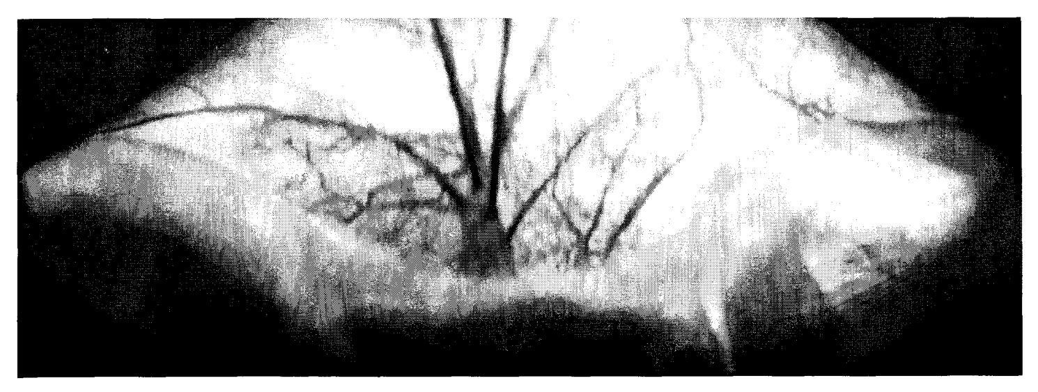
face to face: tree