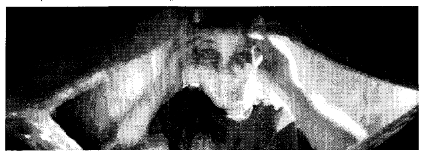
face to face: Emmett

The artist's mouth becomes an organic flexible metric. The amount of the subject held between the lips reveals the distance between the artist and her subject, and therein a relationship is inferred. The foreground holds within its V-shaped armature the compositional middle ground and background, which exist in illuminated space. In "Grace," the framed contents allow viewers to read the curtains being drawn back. Since movement is exaggerated at close range, faces blur and details are diminished. For Hamilton's portraiture, the body of the subject is removed, but may be present as the source of vibrations within the frame. Character is neither veiled nor magnified, but allowed to reveal itself slowly. The subject needn't bother to comb her hair. The aura of the original subject transcends particular detail, and the communicative, haptic gesture is conveyed poignantly in the reproducible form.