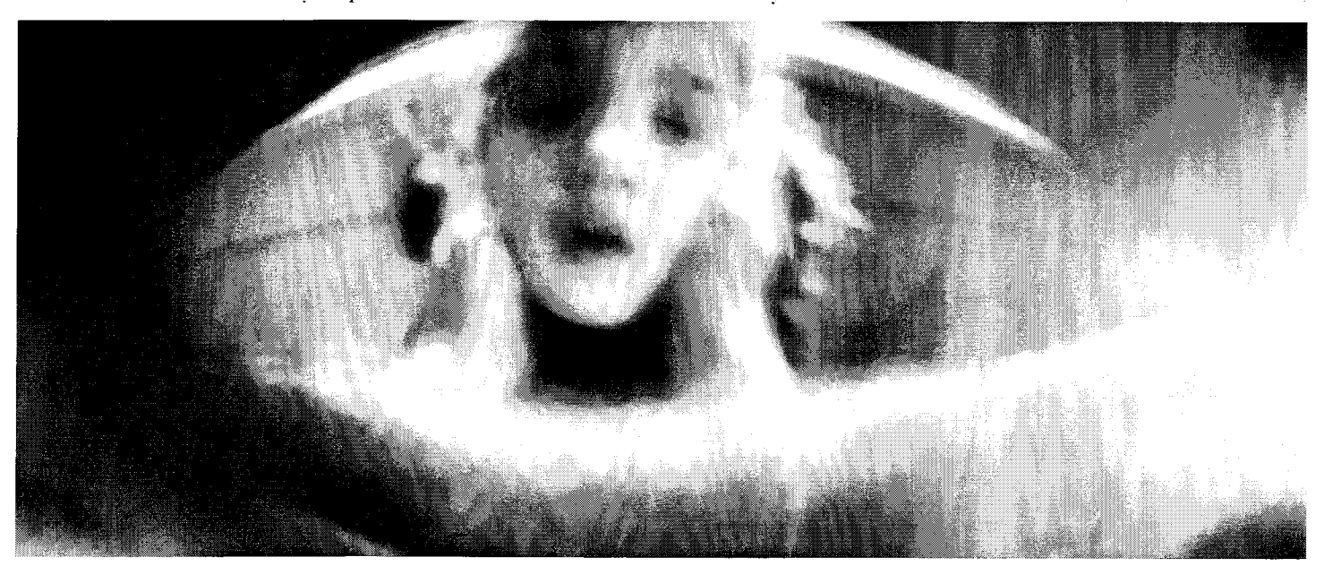
face to face: monnett by Ann Hamilton

Variables of control allow for manipulation of possible views of the subject's space, light and time. The act of mechanical reproduction replaced the aura of the work of art to in turn make way for new means of communication, commodification.